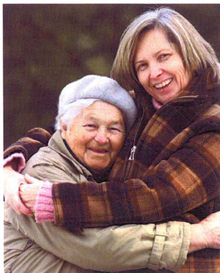
2012 Clearwater Walk Honours ALL CAREGIVERS

Walk: 10 a.m. - Noon (Registration: 9:30 a.m.)